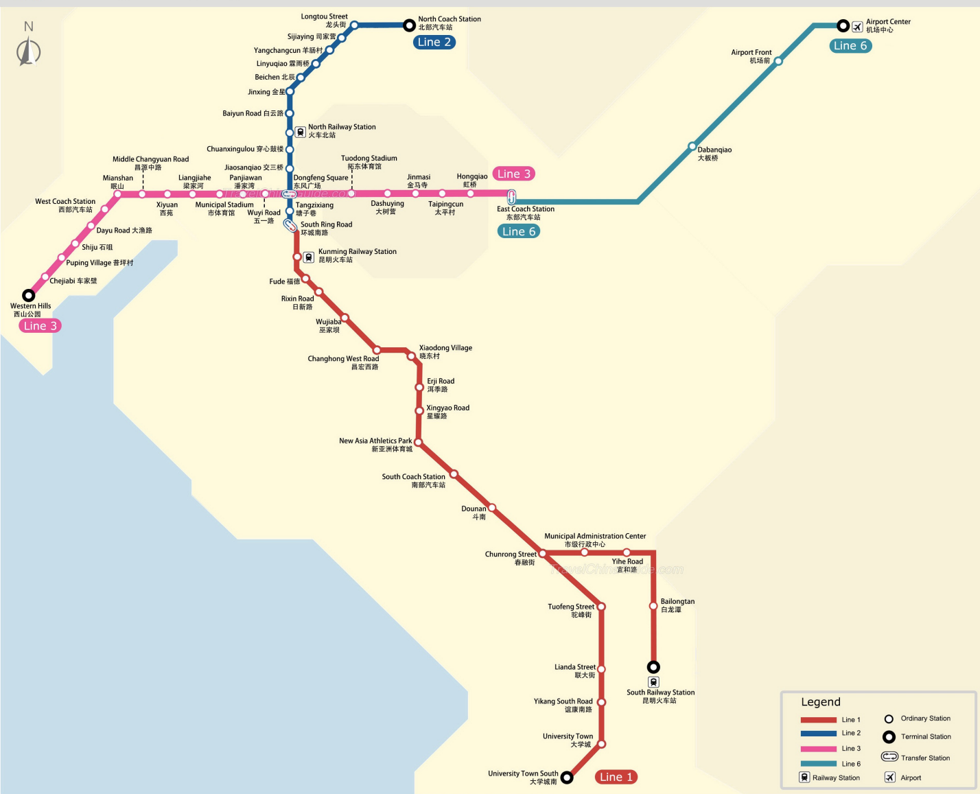
Kunming Subway Map (Click to Enlarge)

Kunming Metro, or Kunming Rail Transit, is a rapid transit system in Kunming, the capital of Yunnan Province. With a population of just over 3 million people, Kunming was one of the largest cities in China without a metro system before its construction.